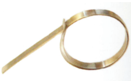
Tie-Dex (Coiled double wrap)

Tie-Dex Bands and Tie-Dex Micro provide a permanent shield termination for any size and type of back-shell design.